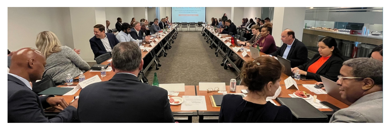
On November 6, the Coalition co-convened 60 business, public health, and advocacy leaders from over 45 organizations to discuss strategies for how to equitably expand access to HIV prevention services. U.S. Business Action to End HIV I 2023 Impact Report

By engaging the private sector and focusing on health equity, U.S. Business Action to End HIV is committed to strengthening HIV prevention and treatment while building connections to the communities who need it most.