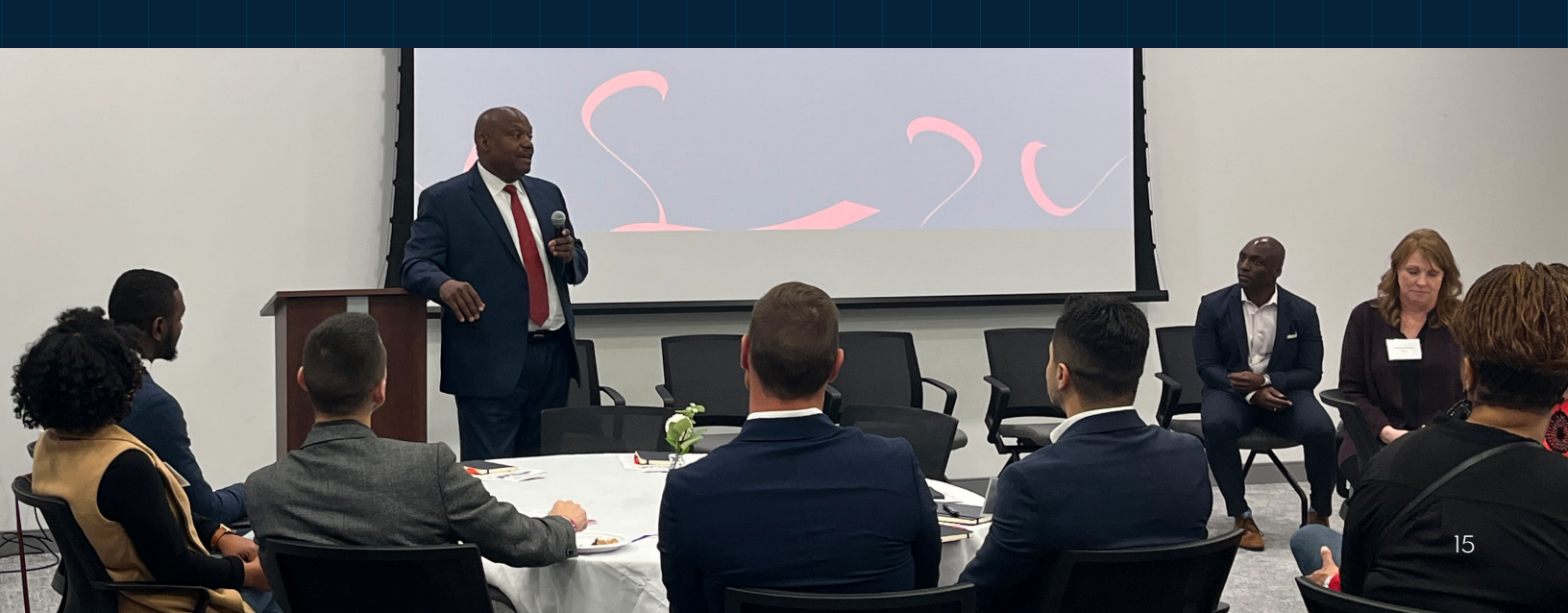
Executive Director, HIV + Hepatitis Policy Institute