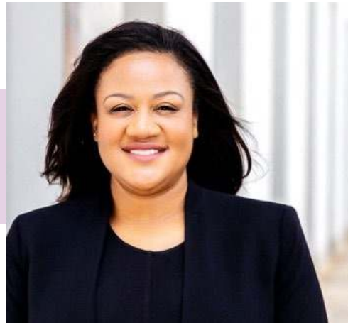
Jimica Tchamako Public Health Informatics Institute