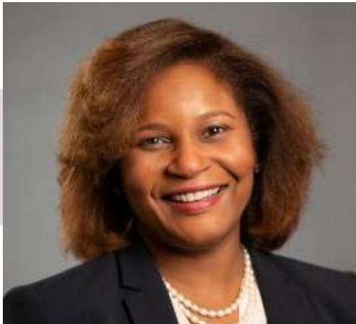
Vivian Singletary Public Health Informatics Institute