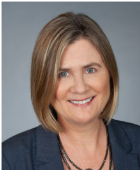
Sara Cody, MD

Over the past year, big city health officials continued to lead the way in solving the complex public health challenges that our communities face. We are honored to work alongside such dedicated colleagues, and we are inspired every day by their commitment to improving the lives of the populations we all serve.